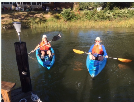
Day at the Creek kayakers enjoy the light breeze.