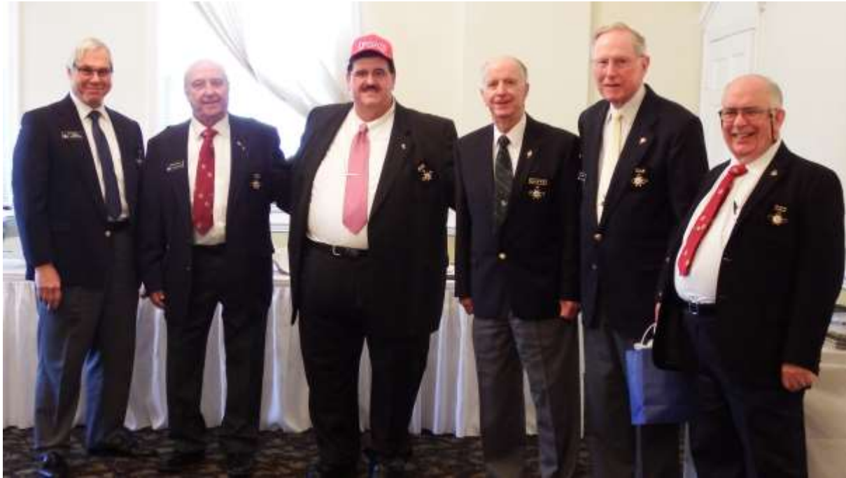
Past Commanders, NVSPS Change of Watch, March 18, 2017