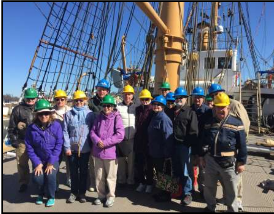
US Coast Guard Barque Eagle Tour, At USCG Yard, Baltimore, MD—April 8, 2017

Thanks to the USCG Barque Eagle Crew for a very thorough tour of all 295 feet. We'll never forget it.