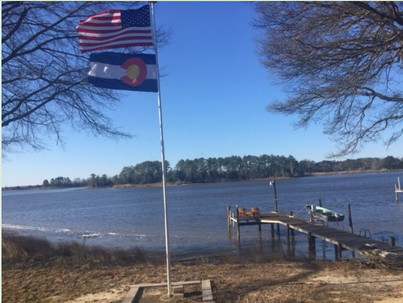
View of our creek at low tide with winds from northwest. How low it can go!

I can hardly believe, as I write this, that Spring is 6-Days away. The wind is blowing at a great clip (about 25 knots) burr! The creek is following in and out and we have had tide changes of 3 feet daily for a while. Dave and I checked on L. Stanley Sunday and other than being cold the cover is holding strong. Wish Spring would arrive early. We should perform quite a few maintenance and repairs this year, as well as sand, paint, and wax. Dave must fix the hatch motor and do some repairs to the fuel system. It never ends. Even when the fun is just around the corner.