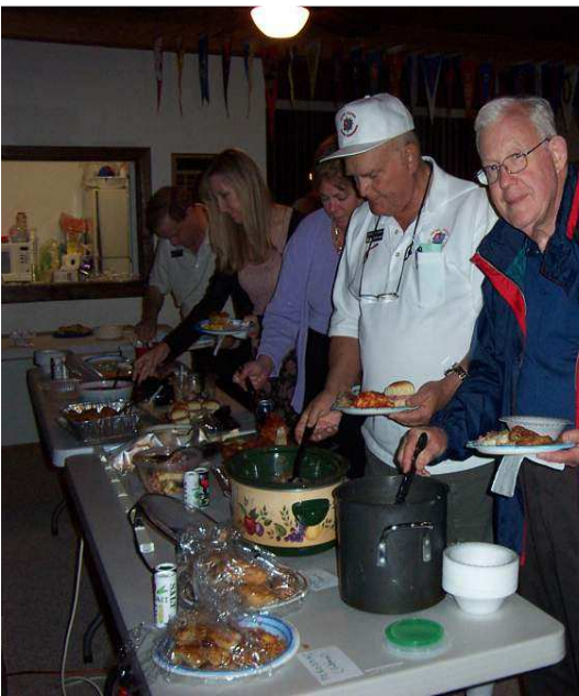
Happy pot-luckers load up at Fairfax Yacht Club

Weatherwise – If we don't have some rain soon, we'll need to have wheels installed on our boats. Keep a weather-eye on the changes that are coming. Also, watch out for those gusty northwesterly winds after a cold front passes the area and high pressure builds.